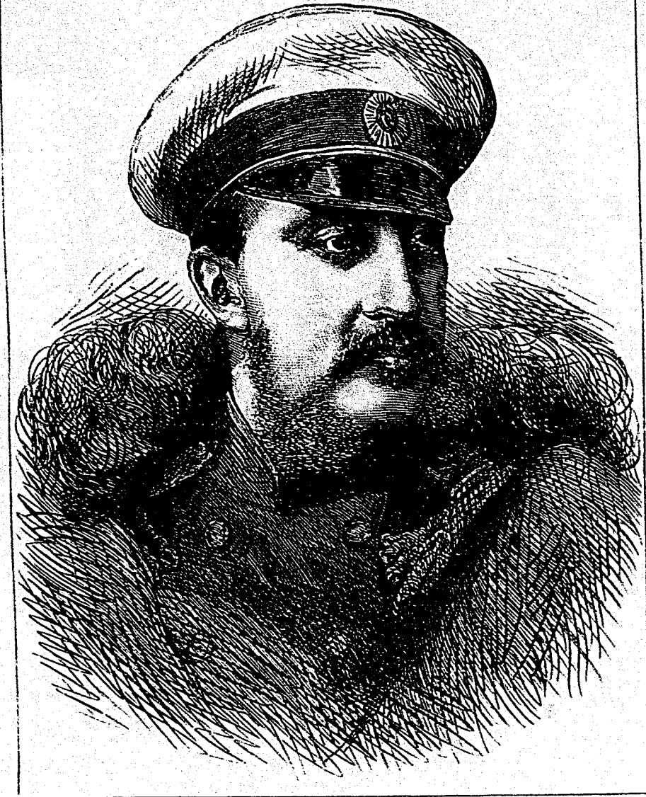
THE GRAND DUKE NICHOLAS, COMMANDER IN CHIEF OF THE RUSSIAN FORCES.