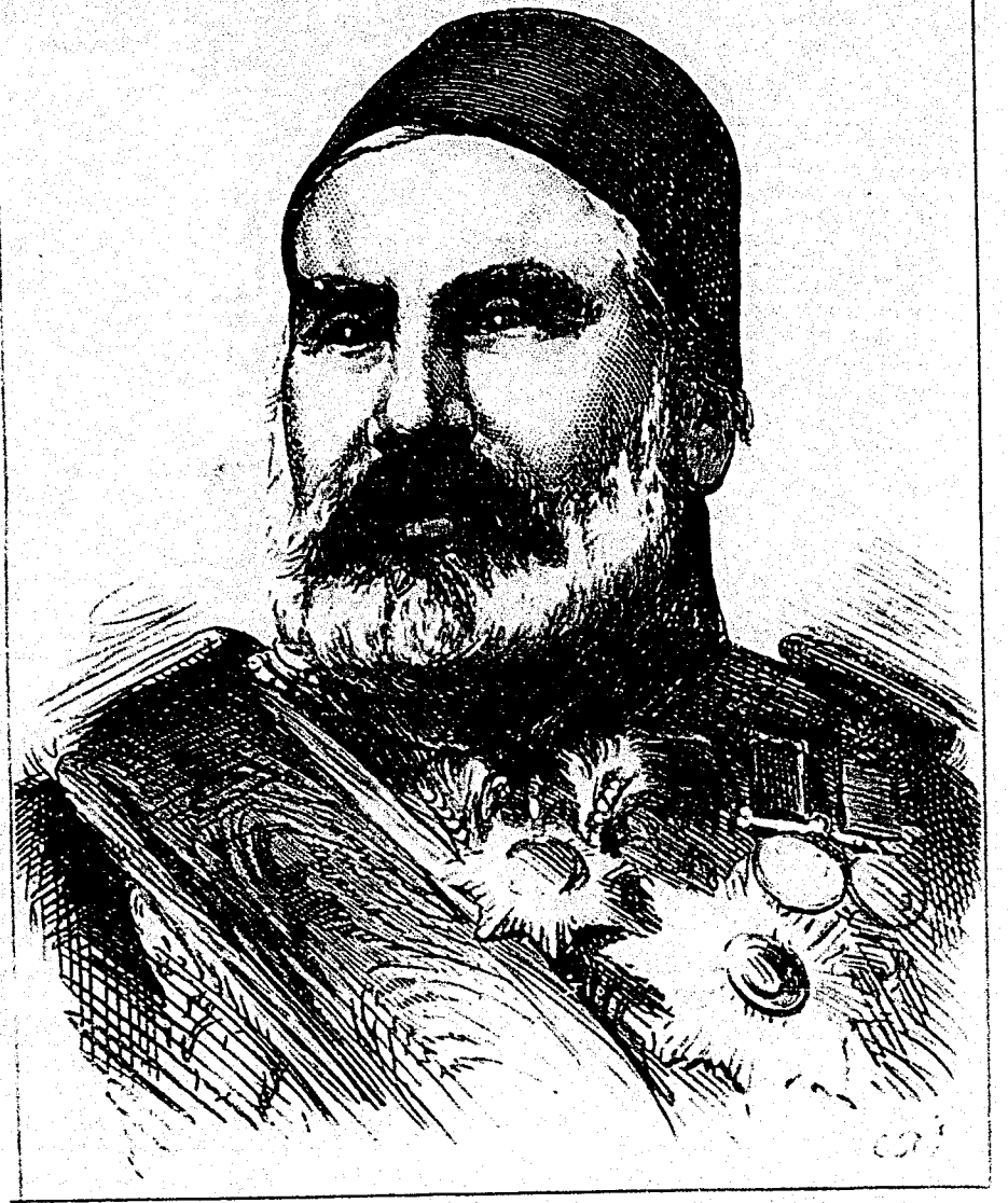
ABD-UL-KERIM PASHA, GENERALISSIMO OF THE TURKISH ARMY.