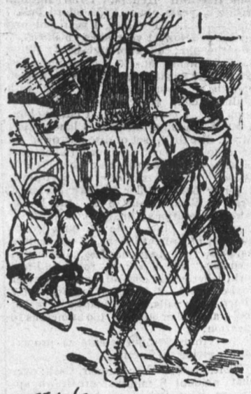
Swiftly Joseph Stag Trudged Towards Home, Dragging Carolyn May Behind Him.

"I can see you're all of a-twitter," he returned absent-mindedly. "What's the matter?" "Oh, you never could guess!" was Carolyn May's introduction, and forthwith, in breathless sentences, went out