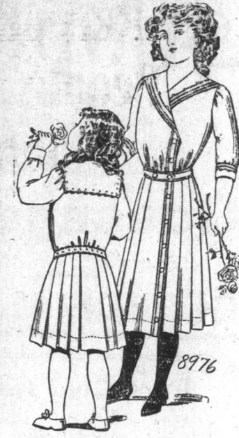
Girls' Dress With Side Closing and Sailor Collar—(With Long or Shorter Sleeve.)

8976—A SIMPLE DRESS FOR THE GROWING GIRL.