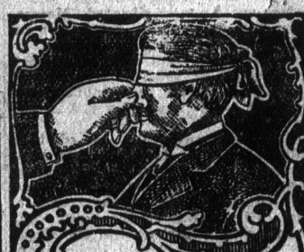
The Doctor Leads Him by the Nose

The following from the Essex Free Press is worthy of thought in other towns, much nearer home:—It is a noticeable and frequent occurrence in our towns for young ladies between the ages of 15 and 16 to be parading around the streets till late hours, when they ought to be home. It is a pity that some mothers in town would not take a little interest in the welfare of their daughters and take