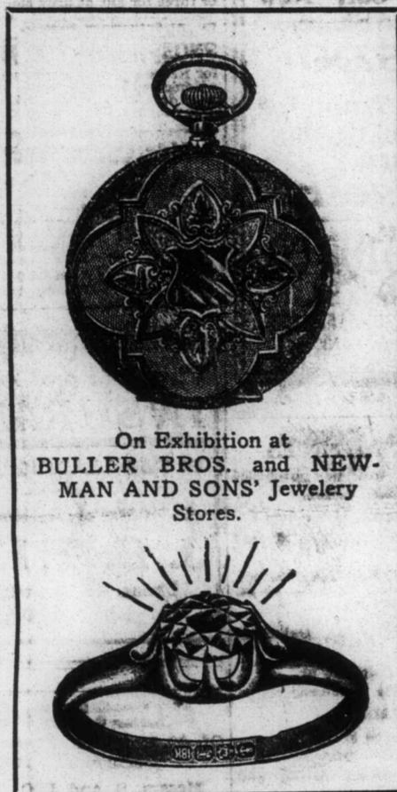
On Exhibition at BULLER BROS. and NEW-MAN AND SONS' Jewelry Stores.

Big Club Offer Ends 8 p.m. Saturday, Oct. 21