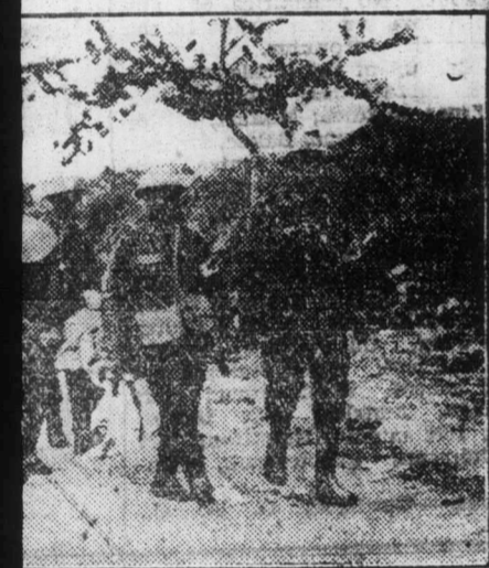
Official Film, "Battle of the Somme."

Advertising ation of all success- ses—and a good ad- ognizes the value of ium! Try Classifieds