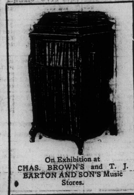
On Exhibition at CHAS. BROWN'S and T. J. BARTON AND SON'S Music Stores.