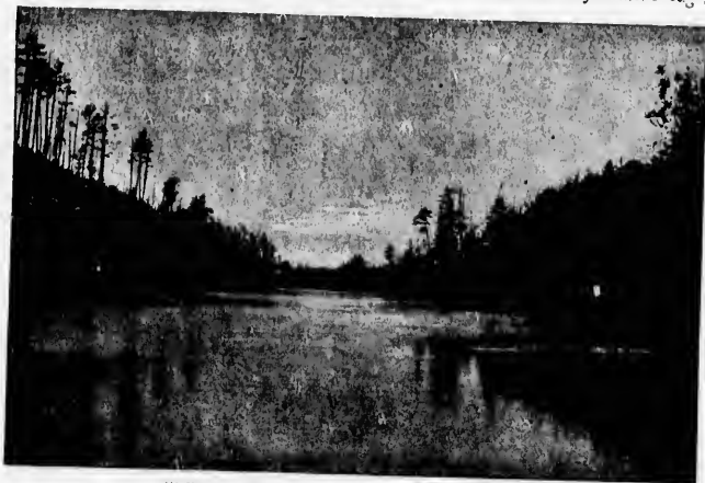
FRENCH RIVER, NEAR EAGLE'S NEST CLIFF.

The round trip from Collingwood, Meaford or Wiarton, occupies about six days, and as the ticket includes meals and berths, the appetizing influence of the lake breezes and the excellence of the cuisine conspire to make the journey one of both health and pleasure as well as inexpensiveness.