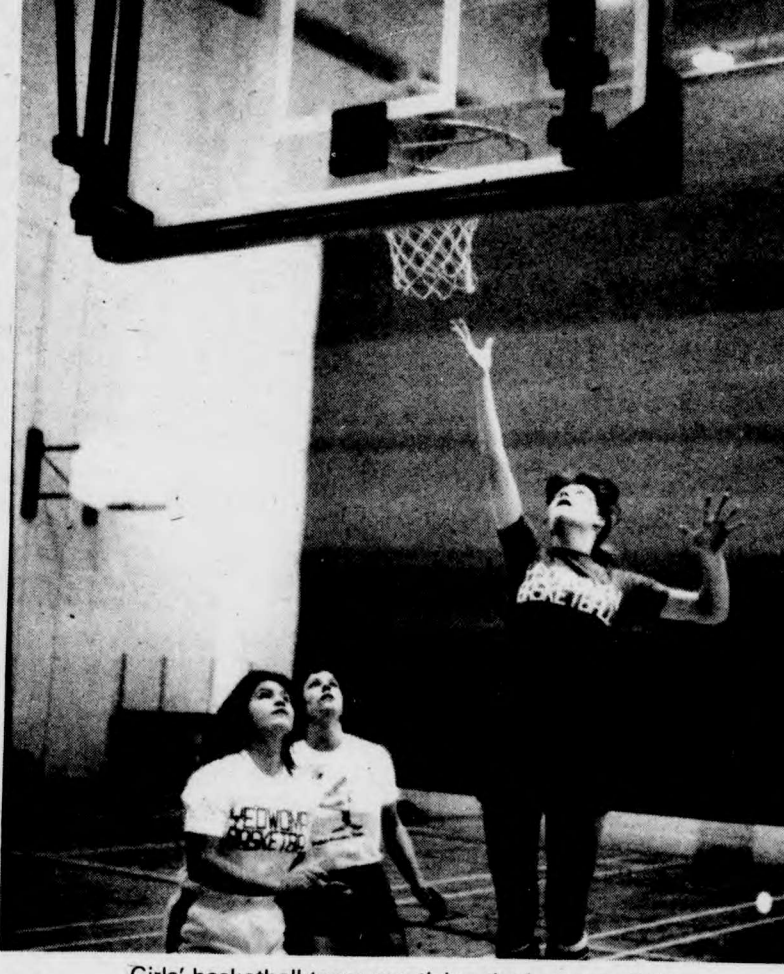
Girls' basketball team practicing the lay-up at Tait.

"If you set your goals only at winning, losing is a really depressing experience. But if you go out on the floor just to play your best, you're more relaxed modest statement to make, and you end up winning anyhow".