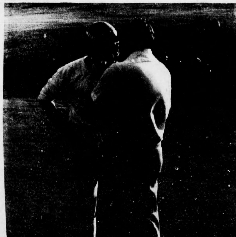
Bomber coach talks things over