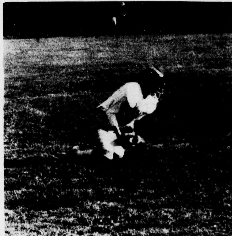
A near miss