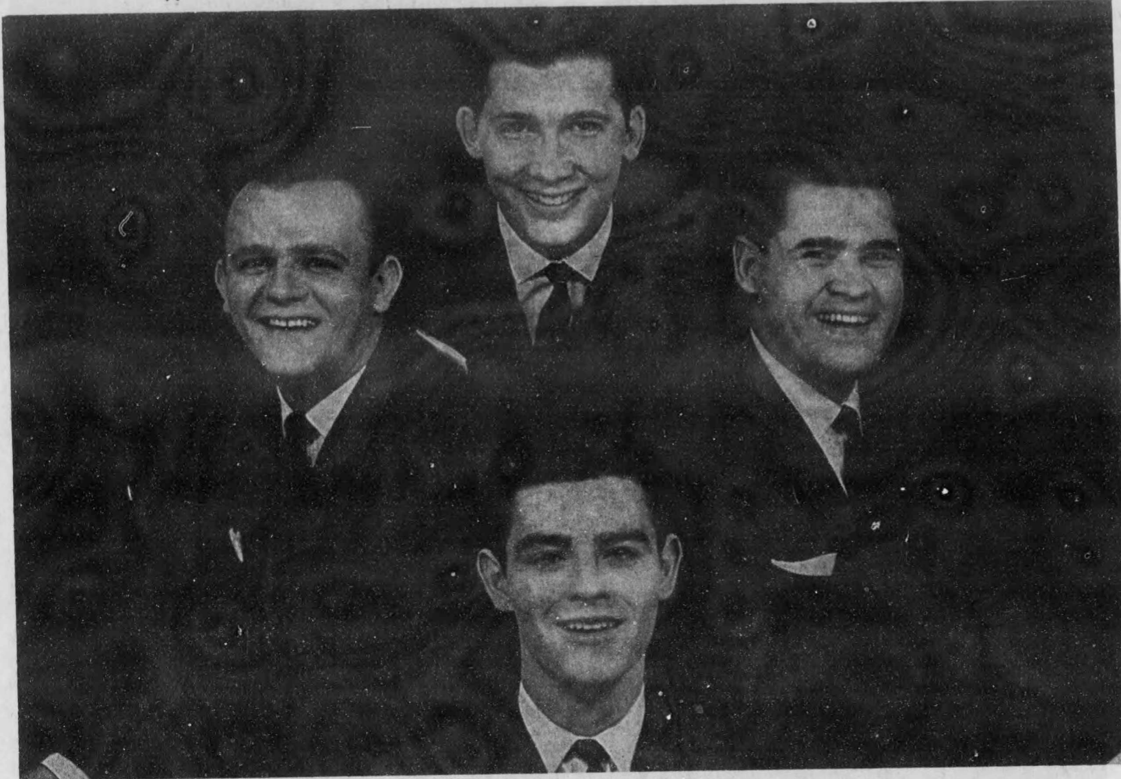
THE FOUR SAINTS

By now you must have heard that the Four Saints play anywhere from five to five hundred different instruments. This colorful and unusual quartet hail from Washington State, where they met and formed a group in High School. After college, they began to tour the West Coast playing engagements in top supper clubs. With their songs, music and excellent comedy they were not long in gaining recognition as first rate entertainers.