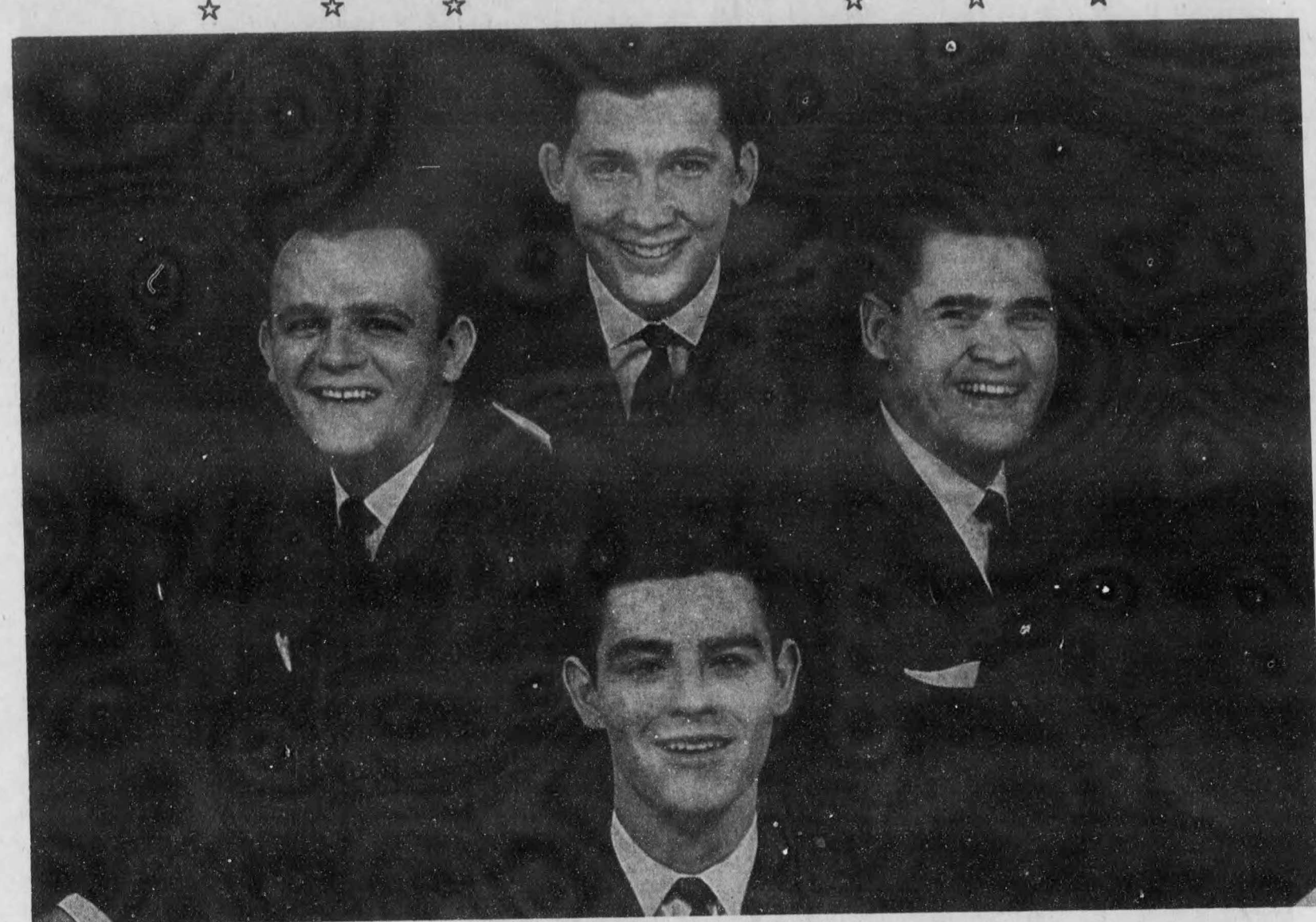
THE FOUR SAINTS

By now you must have heard that the Four Saints play anywhere from five to five hundred different instruments. This colorful and unusual quartet hail from Washington State, where they met and formed a group in High School. After college, they began to tour the West Coast playing engagements in top supper clubs. With their songs, music and excellent comedy they were not long in gaining recognition as first rate entertainers.