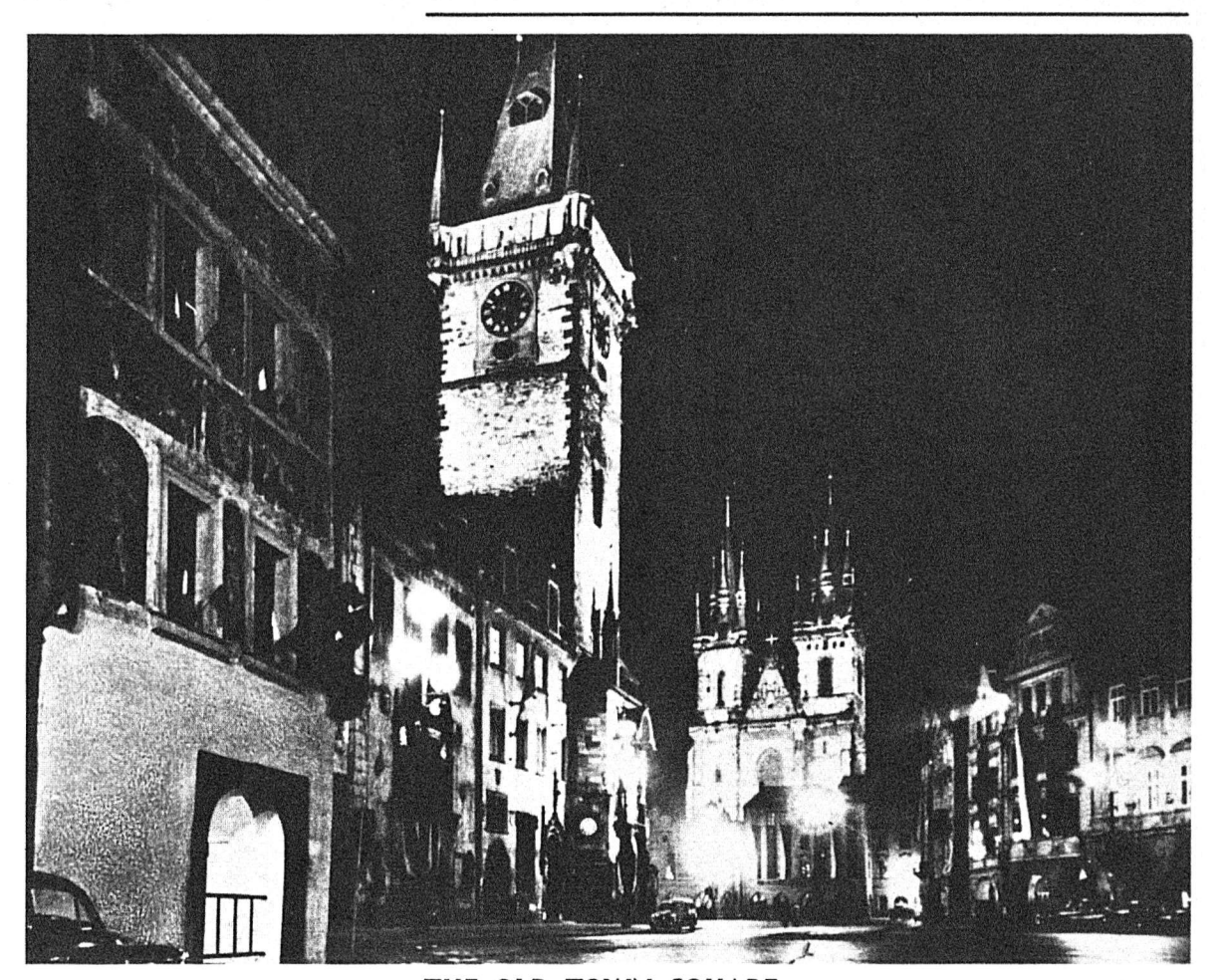
THE OLD TOWN SQUARE