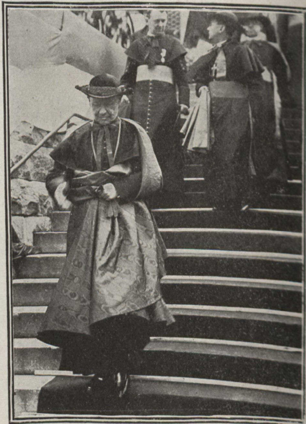
The Ceremonious Arrival of a Great Dignitary at Montreal