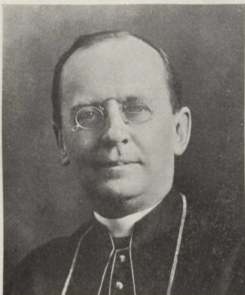
Most Rev. Paul Bruchesi Archbishop of Montreal

In the whole world there are no two cities better suited to the requirements of a great church or historic festival. Fortunes have been spent in Montreal to decorate the city, becoming such an august assemblage of dignitaries. In Quebec the civic and provincial government representatives turned out to extend a welcome. In Montreal Archbishop Bruchesi had for weeks been general-in-chief, planning and carrying out the great scheme of adornment on a scale never before attempted even in that city of festivals and pageants. Sunday next the great congress will be wound up with a triumphal spectacle. Imagination has been at a grand height; a panorama of pomp and circumstance, beside which the Canadian National Exhibition with all its hundreds of thousands seems but a drab affair belonging to a practical people.