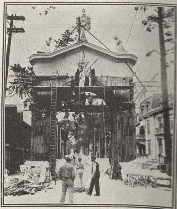
Building central arch on St. Hubert Street. Lath and plaster are the main materials used. The figures and decorations are cast separately and then placed in position.