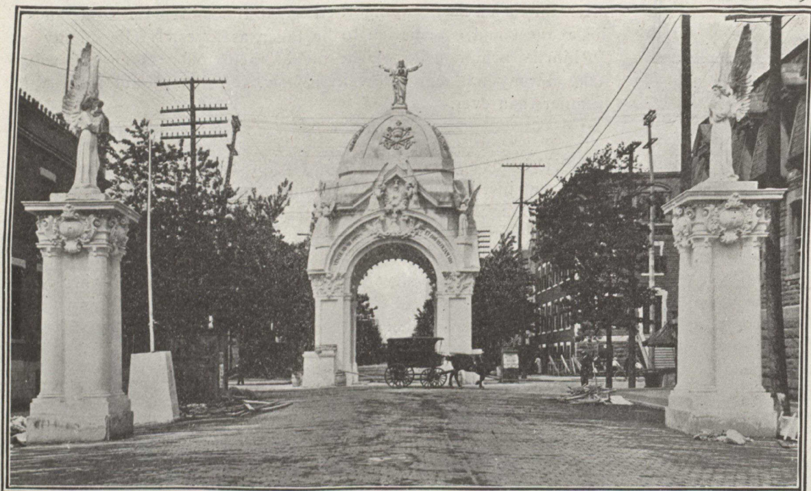
How Montreal's streets are decorated. The pylons and flag-poles are placed about every fifteen yards along the route of the procession. There are a number of these central arches at various points.