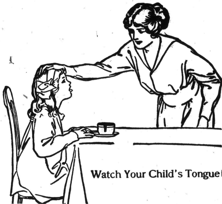
Watch Your Child's Tongue!

Will "Prairie Maid" and "Looking Forward" kindly send their name and address to the Editor.