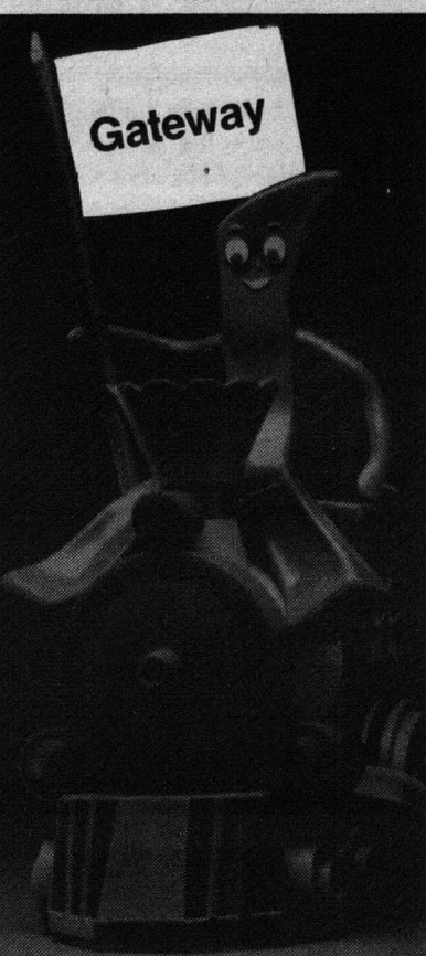
ever wonder what Gumby did before he started hanging around Pokey?

Lost — Ivory bracelet with Silver ornamental clasp — great sentimental value — Reward 464-1091.