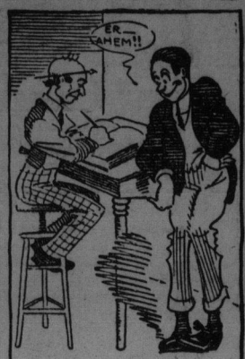
He Hastily Frisked Himself.