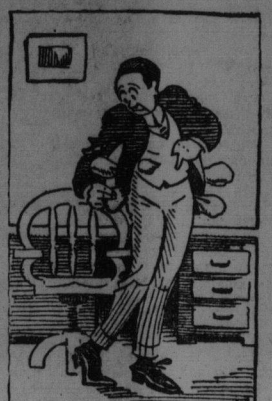
"Lend Me Two Bucks."