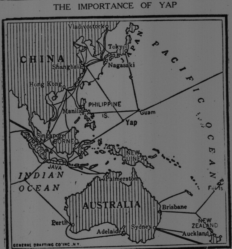
Little island in the Pacific over which Japan declares she will exercise mandate, to which the United States objects. From the New York "Globe."