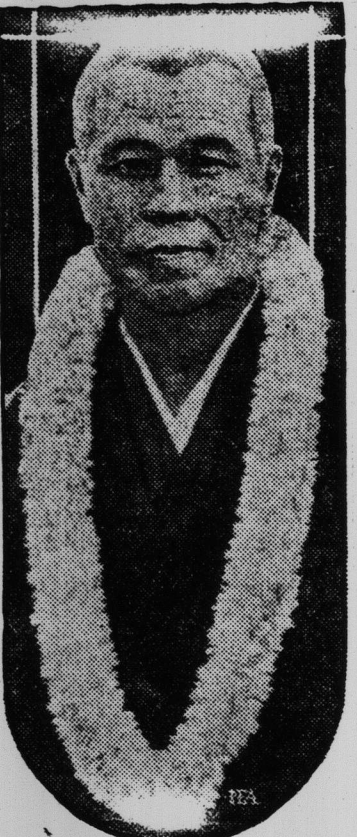
Tenko Nishida, known as the "Ghandi of Japan," and one of the Orient's most distinguished philosophers and religious leaders, is beginning his first tour of the United States. This picture was taken on his arrival in Los Angeles.