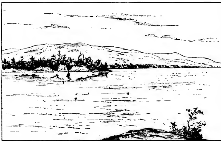
FIG. 2.—TREMBLING MOUNTAIN, AS SEEN FROM SOUTH-WEST SIDE OF TREMBLING LAKE.