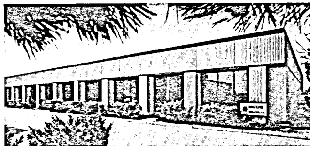
Shown above is the Mississauga (Toronto) facility conveniently located close to Toronto International Airport. This location houses a fully equipped applications laboratory as well as servicing warehouse, ordering and shipping facilities.

Solving chemical analysis and purification problems takes a lot more than just quality instrumentation. It takes a knowledge of chemistry and the ability to apply it in the form of problem solving chromatographic