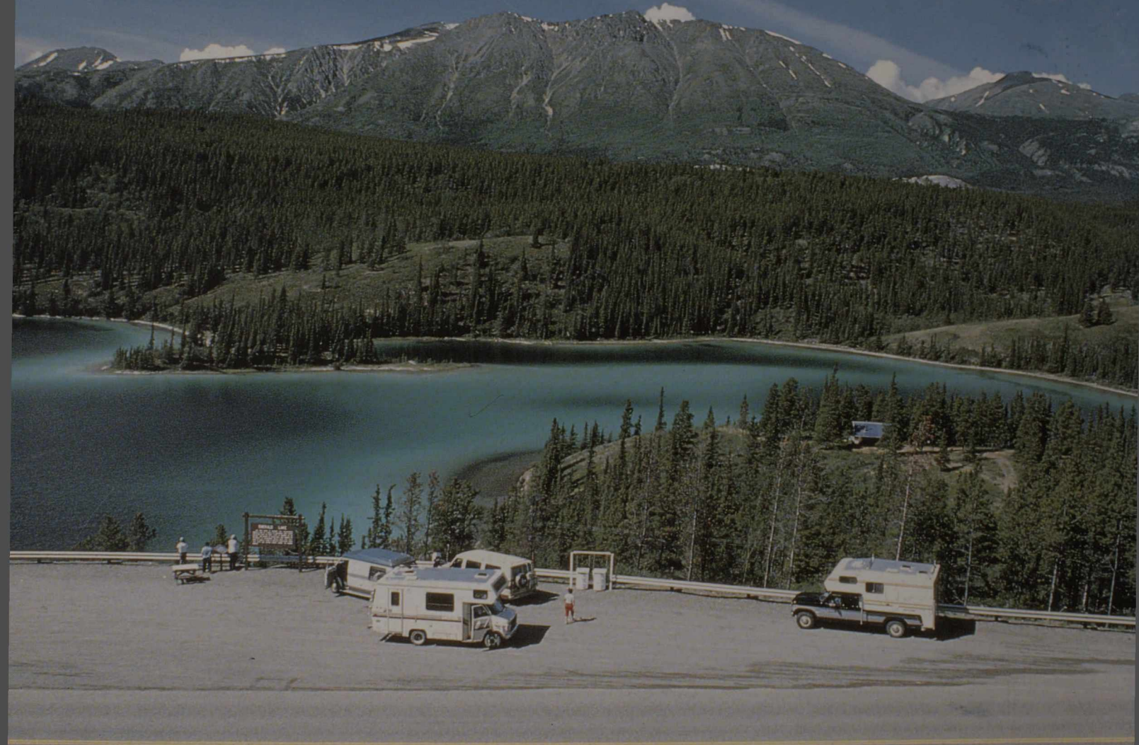
Picnic site at Emerald Lake near Whitehorse.

RIGHT: Dawson City, at the confluence of the Klondyke and Yukon Rivers, was the centre of the gold rush in 1896. Today the former Yukon capital is home to 1600 year round residents, but at its peak it had a population of some 30000 miners and adventure seekers.