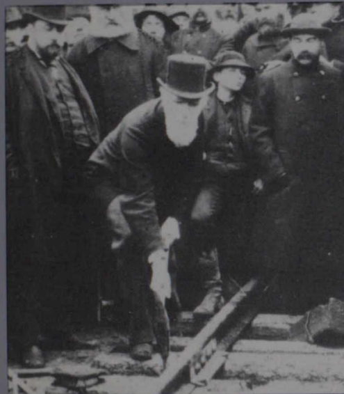
VANCOUVER CITY ARCHIVES