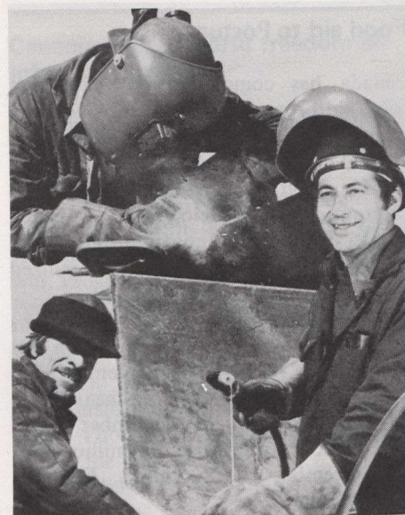
The complex had a peak work force of 18,000, comprising a variety of jobs.

There is a campsite for each major jobsite which, although temporary, provides the comforts of modern living. At the peak of construction 1978-1979, the