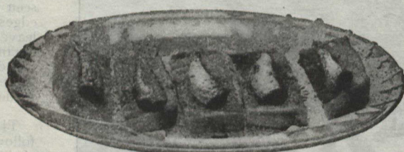
Sardines are very good grilled

A CAN of salmon may be used or an equal quantity of left-over sea salmon, 2 eggs, ½ cup bread crumbs, salt, pepper, 1 tablespoon melted butter, complete the ingredients required. Free the fish from skin and bone and flake with a fork, mix the other