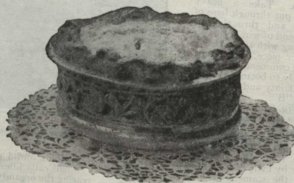
Fish pie with a deep "crust" of mashed potato

Select several large potatoes, cut them in half, lengthwise, scoop a hollow in the centre of each, leaving a wall sufficiently thick to hold the fish mixture. Make a roasting pan hot and melt some bacon dripping and