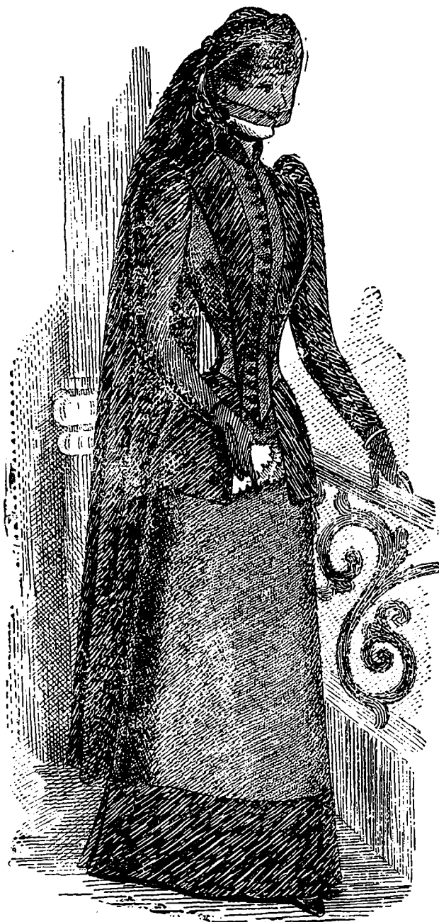
FIG. 31.—No. 5041.—LADIES' HOUSE WAIST. PRICE 25 CENTS.

Quantity of Material (27 inches wide) for 30, 32, 34 inches, 3½ yards; 36 inches, 3½ yards; 38, 40 inches, 3½ yards; 42 inches, 3½ yards.