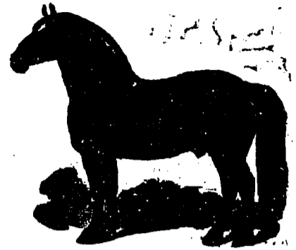
Patrole No. 200 (1187).