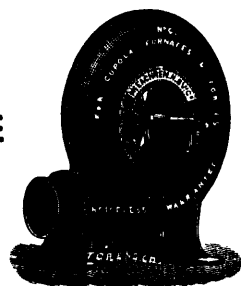
Steel Pressure Blower for blowing Cupola and Forge Fires

PATENTS The Toronto Patent Agency, Limited CAPITAL - - - - $25,000.00.