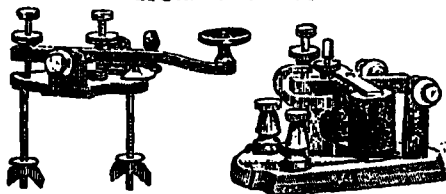
HUREKA No. 1.

Sounder, - - - - $2.50 Key, - - - - 1.50 Complete Outfit - - - - 4.75