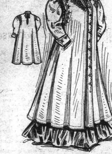
"THE DUVAL." A very handsome coat, in fine cloth, dark green, brown and navy, fitted with cape and bishop sleeves, lined to waist with satin. Price, $22.50.