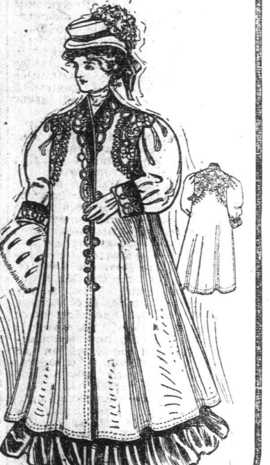
"THE BYDE." In durable tough tweeds, fine cloth and shadow checks, has new long collar and turnover cuffs. Price, $35.00.

OUR COAT SECTION has received a large accession of business from the first arrivals of our exclusive COAT CREATIONS. Saturday saw further arrivals, and on Monday we unpack still more of these exquisite productions. This advertisement shows you six of our new London and Paris coats—exclusive styles—the creations of master tailors—which cannot be duplicated elsewhere, but they cost no more than the ordinary coat, the garment which just misses the mark, because it is merely a type of many and has no distinction nor individuality.