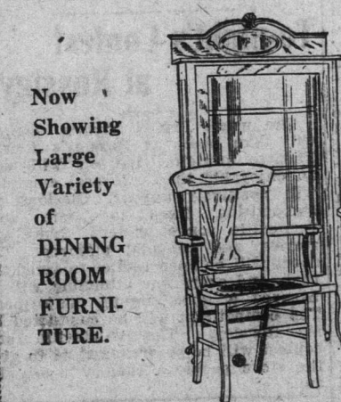
Now Showing Large Variety of DINING ROOM FURNITURE.

Quarter Surface Oak, golden finish, square top, extends 6 feet on good heavy legs. Value $35.00 for . . . $31.00