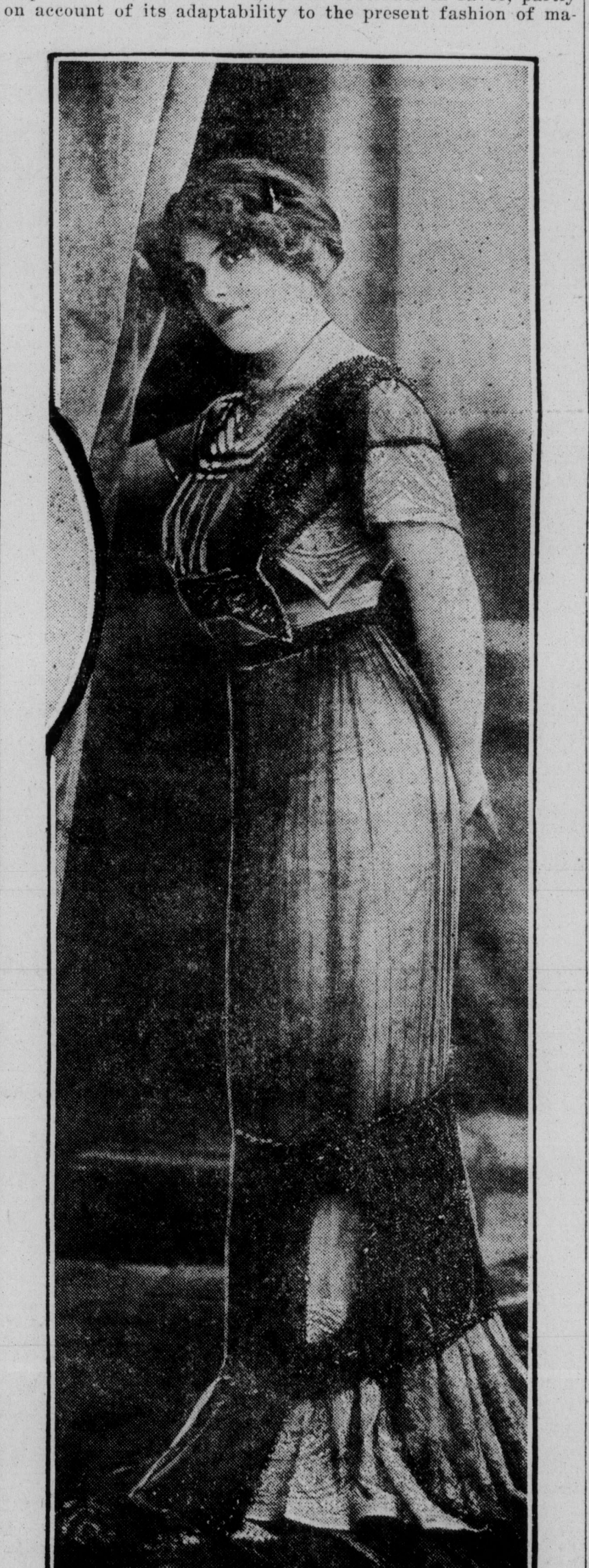
Black Silk Voile Gown Embroidered with Pearl and Jet Over Pink Lining

An afternoon gown of soft silk and wool material or crepe the finger-print fear entered into the stuck in the detective's mind. would be charming made like a model shown in New York. It calculations of the cracksman. emphasizes the tunic effect, which continues in favor, partly