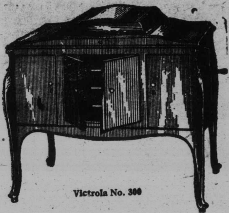
Victrola No. 300

THE VICTOR COMPANY ORIGINATED THE MODERN TALKING MACHINE AND WAS THE FIRST TO OFFER THE PUBLIC HIGH-CLASS MUSIC BY GREAT ARTISTS. VICTOR SUPREMACY BEGAN THEN. IT HAS BEEN MAINTAINED BY THE CONTINUING PATRONAGE OF THE WORLD'S GREATEST MUSICIANS AND BY THE MERIT OF VICTOR PRODUCTS.