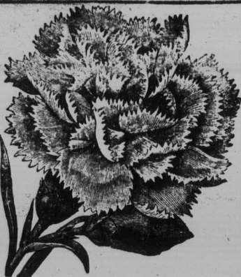
Giant Flowering Carnation

fragrant and the plants do well outdoors. Transplanted into pots in the early fall they bloom profusely from October till the end of May. Extra plants are easily propagated from them by cuttings, "pipings" or layering.