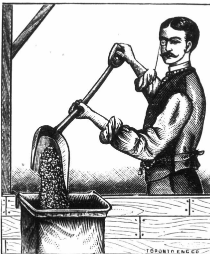
THE NEW STYLE—"No help required. Works like a charm!"

"Look here, upon this picture, and on this."—Shakespeare.