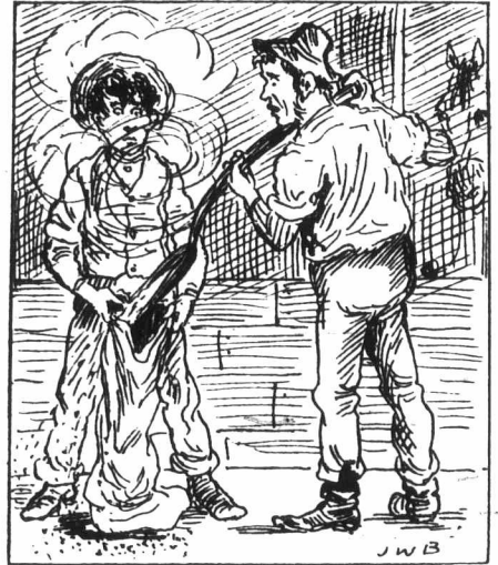
THE OLD STYLE—"Botheration! don't you see the grain's all going on the floor?"