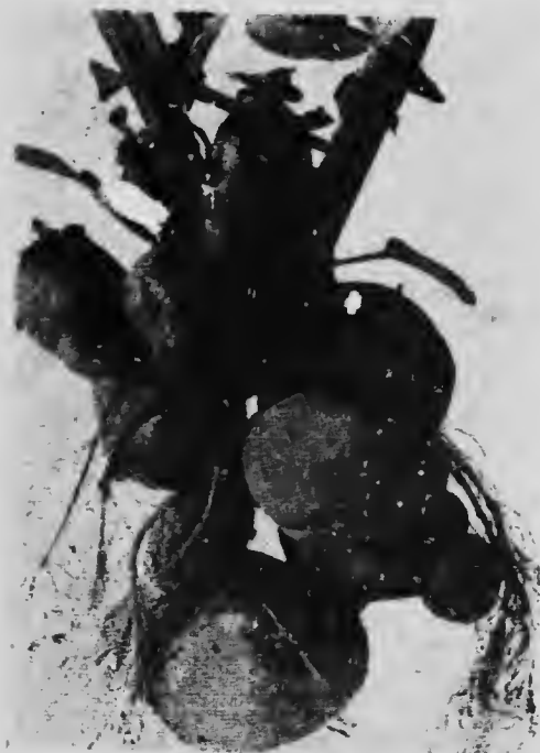
Clusters of tubers formed at the surface of the ground after the parts below had been badly injured by Rhizoctonia.

These are rotted off by a soft bacterial rot.