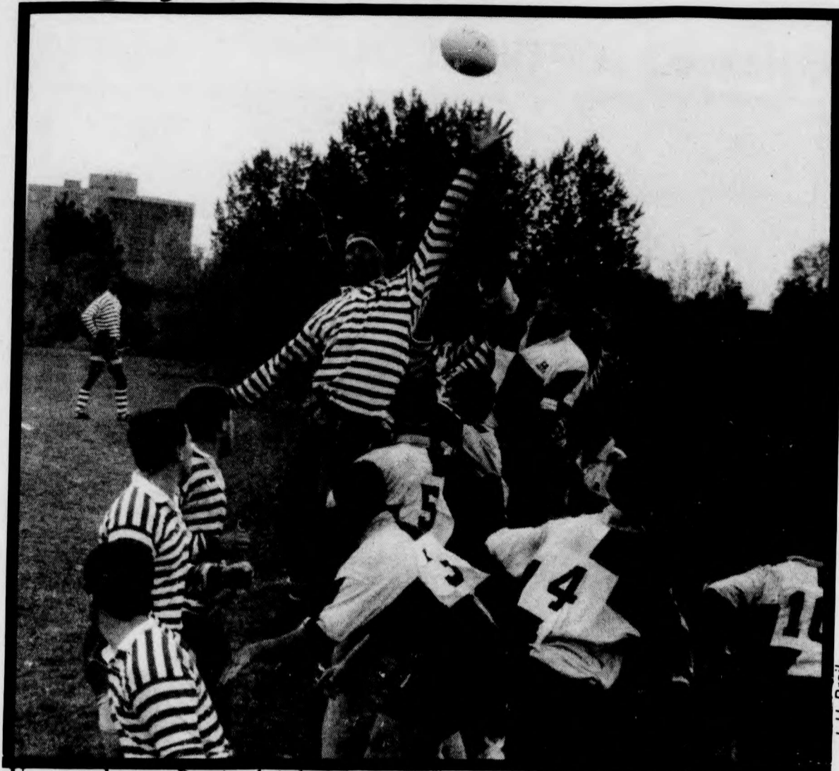
Up, up and away: Despite their highflying efforts the Yeomen lost a close one to the visiting McMaster Marauders.