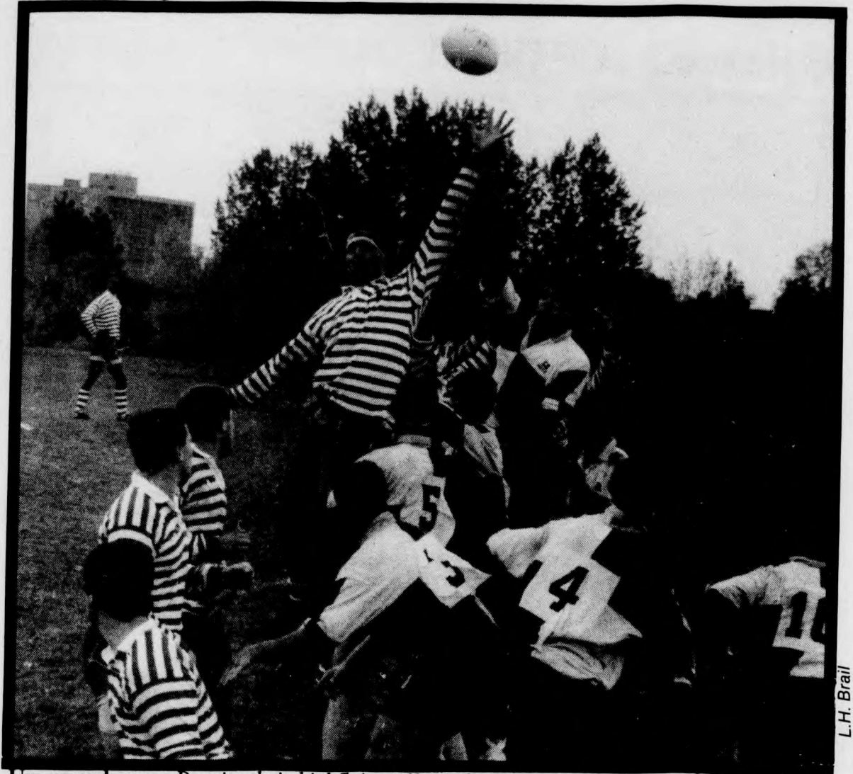
Up, up and away: Despite their highflying efforts the Yeomen lost a close one to the visiting McMaster Marauders.