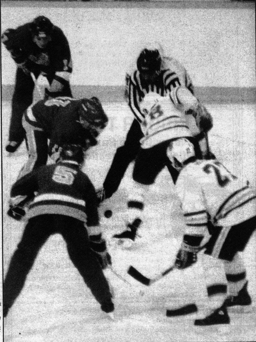
Nuke the Ooks! Face off '86 6:00 pm Sunday

Such catchy phrases were in stark contrast to the otherwise very academic and indecisive debate. Approximately 200 people attended.