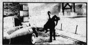
JAMES STEWART KIM NOVAK - ALFRED HITCHCOCK'S 'VERTIGO'