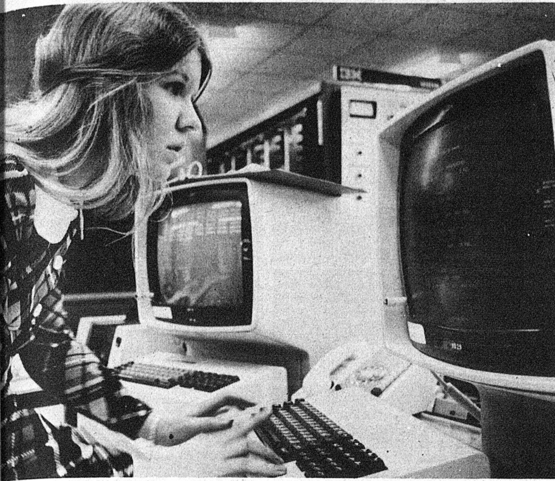
The results could be surprising... Responses to Gateway questionnaires are now being processed and correlated at Computer Services. Check Tuesday's issue to see how much you love to love, hate and ignore Gateway, the Students' Union and the rest of the world.