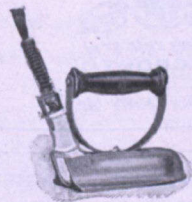
3-pound Flat Iron for Sewing Room or Nursery