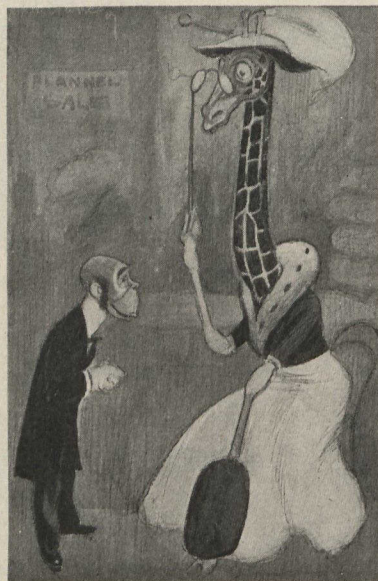
Mrs. Giraffe: "Give me two hundred yards of flannel. My husband has a sore throat."