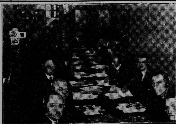
Newspaper men in London and New York held a wireless telephone conversation recently and the photograph shows the room in the General Post Office, London, where the experiment took place.