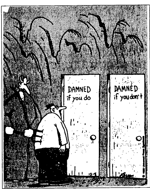
"C'mon, c'mon - It's either one or the other