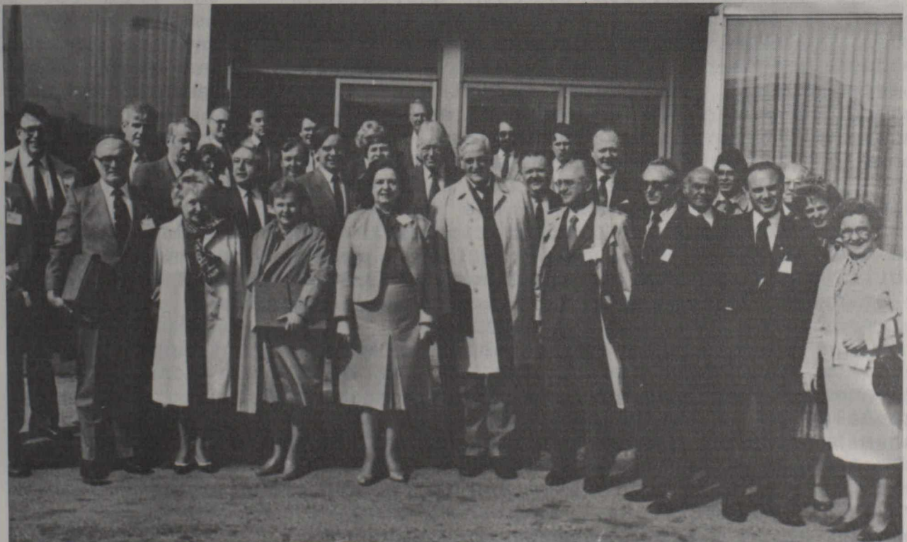
Members of the European and Canadian Parliaments meeting in St. John's, Newfoundland, 8-12 May