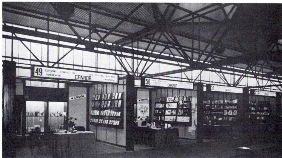
Fourteenth Children's Book Fair, Bologna, Italy, April 1-4, 1977.

The Canadian group negotiated well over 100 options for foreign translations of Canadian books for children. They also made valuable contacts with film producers, such as Walt Disney Productions, who were seeking new subjects.