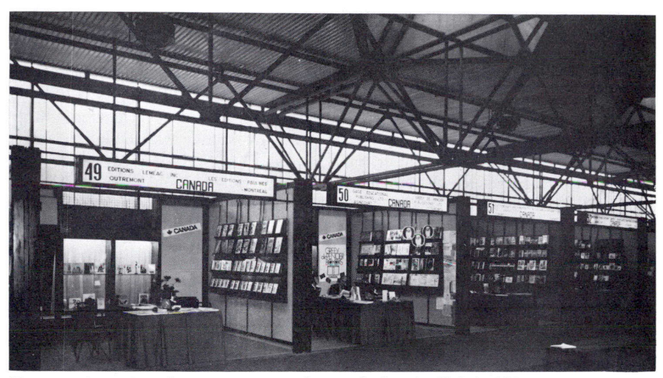
Fourteenth Children's Book Fair, Bologna, Italy, April 1-4, 1977.

The Canadian group negotiated well over 100 options for foreign translations of Canadian books for children. They also made valuable contacts with film producers, such as Walt Disney Productions, who were seeking new scripts.