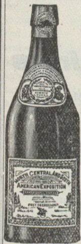
FAC-SIMILE OF WHITE LABEL ALE