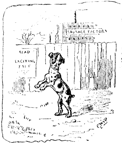
"A SHORT ENDING."