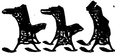
THE "MARVEL" SCHOOL DESK, PATENTED JANUARY 14TH, 1886.

The Canadian Office and School Furniture Co., Limited, Successors to W. STAHLSCHEIDT & Co. Manufacturers of Office, School, Church and Lodge Furniture.