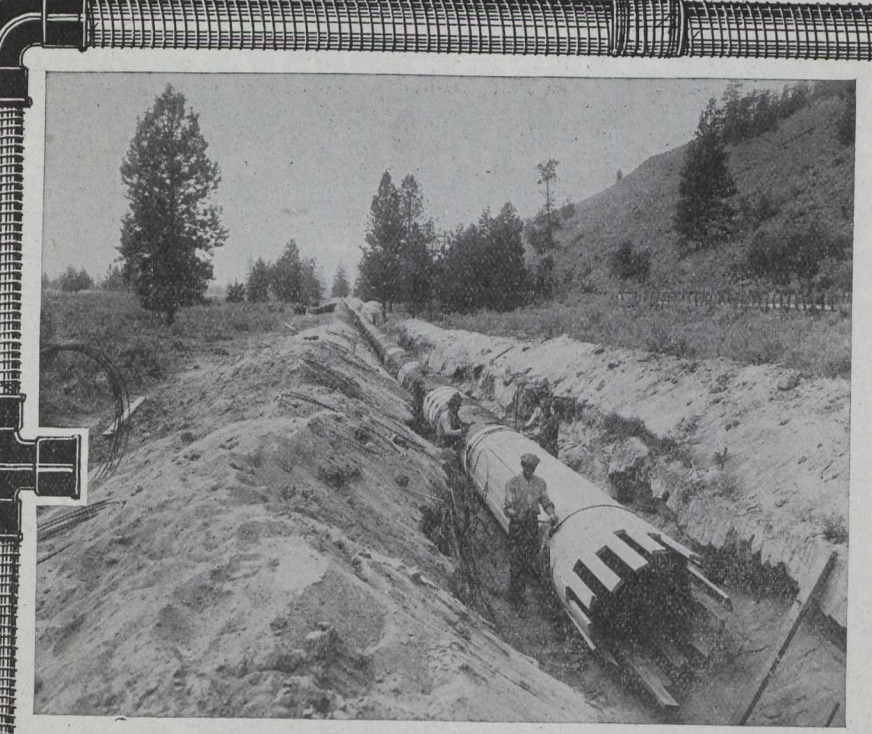
48 in. CONTINUOUS STAVE LINE.

Manufacturer of Galvanized Wire Machine Banded WOOD STAVE PIPE CONTINUOUS STAVE PIPE RESERVOIR TANKS